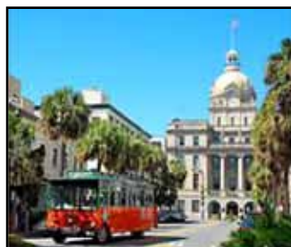
Old Town Trolley

Charleston has often been referred to as a veritable living museum. Places of interest encompass a visit to The Market and a guided tour of the historic district. We will also tour the houses and gardens of Middleton Place and Magnolia Plantation. According to the Garden Club of America, Middleton Place is designated as a National Historic Landmark and "The 65 acres are the most important and most interesting garden in America". Built in 1680, the Magnolia Plantation is the oldest garden on