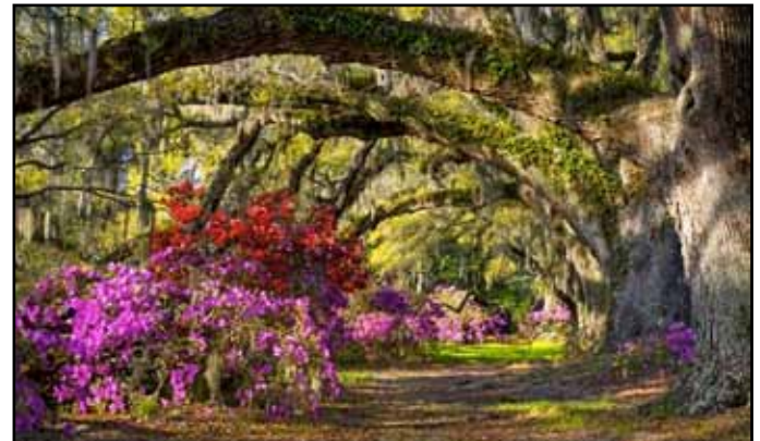
Magnolia Plantation & Gardens

The cost for the trip includes all transportation, hotels, meals except lunch, tours, guides, admissions, and gratuities other than tipping the bus driver. The trip is limited to 52 travelers who must be 21 or older. Much more is incorporated in the price, including a stop on the return portion of the trip to the new National Harbor on the Potomac River in Oxon Hill, MD.