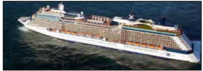
Celebrity Equinox nearing Fort Lauderdale!