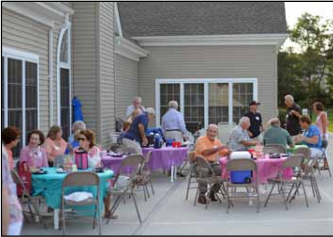
To accommodate the overflow of guests for the Summer Party some moved onto the pool deck to enjoy the delightful evening.