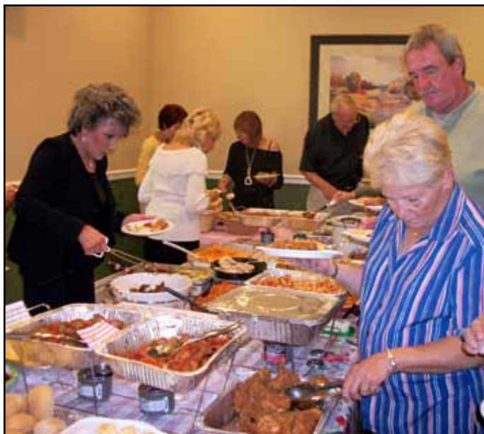
Amazing Pot Luck Buffet