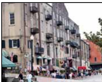
Savannah's River Street

We will focus on the historic districts of both of these fascinating cities. Savannah has been voted the top tourist destination in the US by the readers of Conde Nast Traveler magazine for the past two years. Highlights in Savannah include a visit to River Street, a narrated tour of the historic district on the Old Town Trolley, dinner at well-known restaurants and more.