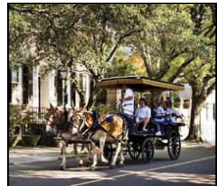
Carriage Tours are a must do in Charleston

We are very excited about sharing this horticultural and historical experience with our friends and neighbors. Come enjoy the attractions of these two southern charmers and experience the glories of spring in a new way.